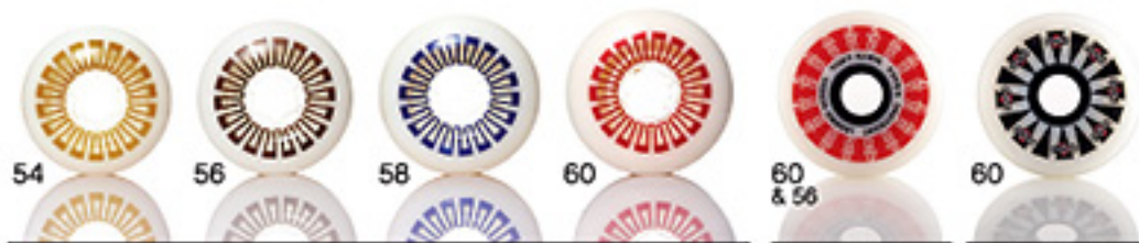
SOFT BLEND 96a