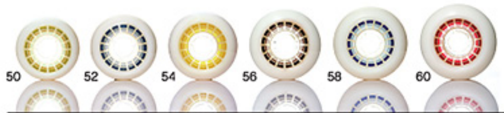
ORIGINAL LINE 98a